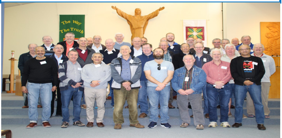
Men Connect gathering held on Saturday 17th June.